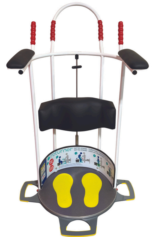
Pivot Transfer Device